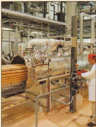
MP3: 2500 l

conditions, at the correct place in the wood structure at the right time. In comparison, the modification of fibre materials is less complex.