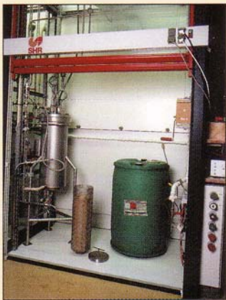
MP2: 25 l