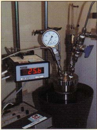
MP1: 200 ml