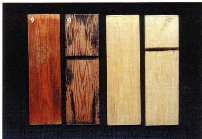
Acetylated wood is UV resistant

The chemistry involved is not particularly complicated. However, the process technology for modification of solid wood is quite sophisticated. It is of paramount importance to combine the right chemicals with the optimum process