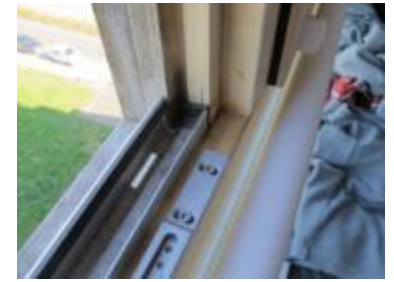
Figure 18: Clean joinery and non-corroded locks.