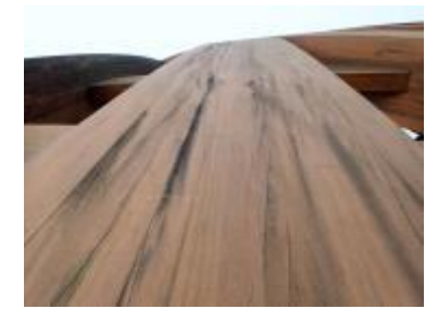
Figure 9: postcentral column with cracks.