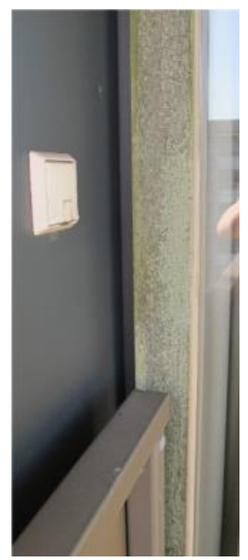
Figure 14: Unpainted joinery with lichen on moisture areas.