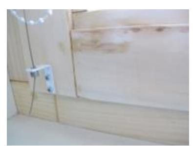
Figure 16: Clean inside timber surface with some brown discolorations.

Opening and closing of the doors and windows as well as the wind and water tightness of the joinery was never a problems. Only in the wet season the consulted residents mentioned that the inside of the turning elements were sometimes somewhat humid. It was not possible to verify this because the inspection was done after a dry period of several days and the moisture content of all the joinery was between 3,5 and 4.5%. No signals of corroding locks were found anywhere in the building, despite the fact that the joinery was unprotected against direct water exposure and assumed water transfer through the wood.