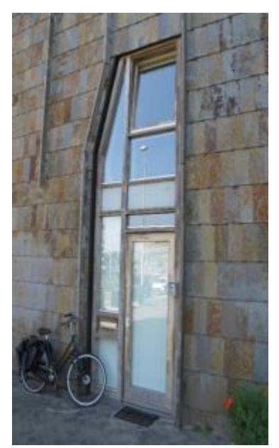
Figure 13: Unpainted joinery, clean, partly homogeneous discoloured, party heterogeneous e.g. door.

joints react differently on exterior exposure (Figure 13). It is unclear if small moisture content differences or if the timber quality itself is causing this effect.