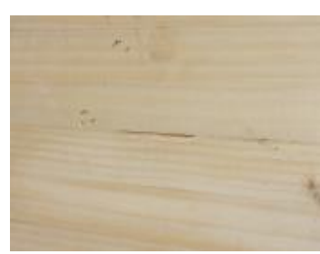
Figure 8: Beam in cycle track Assen with a removed shallow peel which was a resulted of a drying crack.

The cause of the presence of these deeper cracks is not clear and needs further research, but relationships are suggested with the extreme large timber dimensions and heavy exposure.