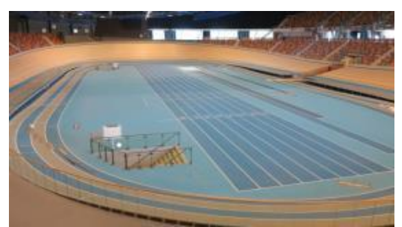
Figure 1: Cycle track with right an opening while the shutter is removed.

On both long sides, shutters are included for opening of the track to enable large equipment to enter the centre of the court, in the 250 m indoor cycle track (Figure 1). In summer the seams at both ends of the shutter are about 10 mm and in the winter they are 7 mm smaller (Figure 2). Calculated with respect to the length of the track, this means a longitudinal shrinkage of about 0.01%, which is ten time less compared to non-treated wood. The moisture content of the modified wood under these indoor track conditions varies in the summer and winter period between 3 and 8%.