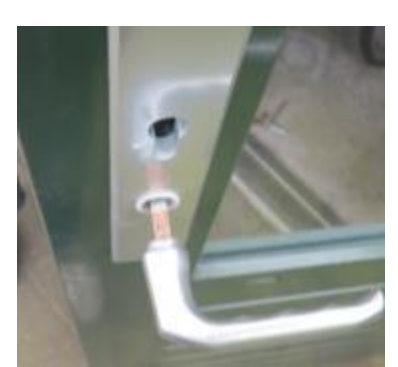
Figure 4: Sheet door which stood frequently open causing water accumulation in the lock resulting in corrosion on the metal parts.