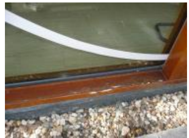
Figure 11: Window frame with high moisture content causing paint damage.

Window frames which were not handled properly in the building phase (Wageningen 2008) caused deep penetration through the end grain of free water into the cell lumen of the timber. During the first several years, these high moisture contents, combined with solar exposure caused severe de-adhesion of the paint. Only after several attempts to repainted the window frames, a stable situation was reached in 2017 (Figure 11).